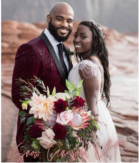
Snow Canyon UT