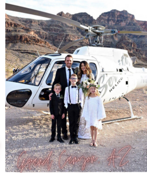
Grand Canyon, AZ