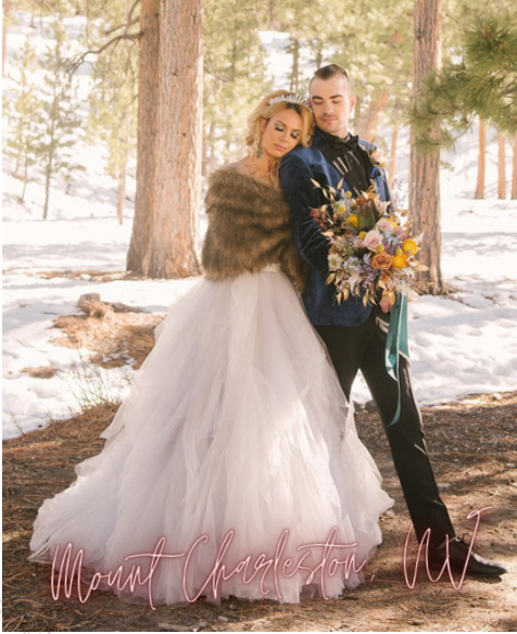
Mount Charleston, WV