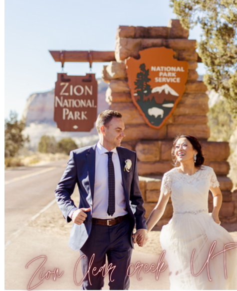
Zion Clear creek, UT